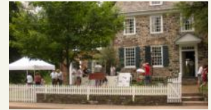
Students Present Exhibits

New Hope History Day was generously sponsored by Mancuso Show Management.