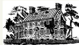
The Parry Mansion

The Newsletter of the New Hope Historical Society