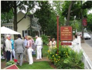
Guests arriving for the event.