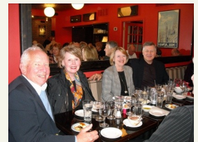
Luncheon at Cavatappo was enjoyed by all !